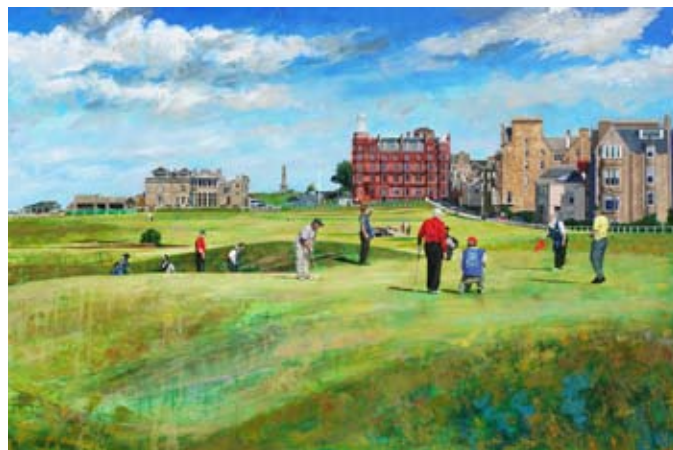
St Andrews (Putting on the Road Hole)

“This is something very new, exciting and different and there are no golf paintings