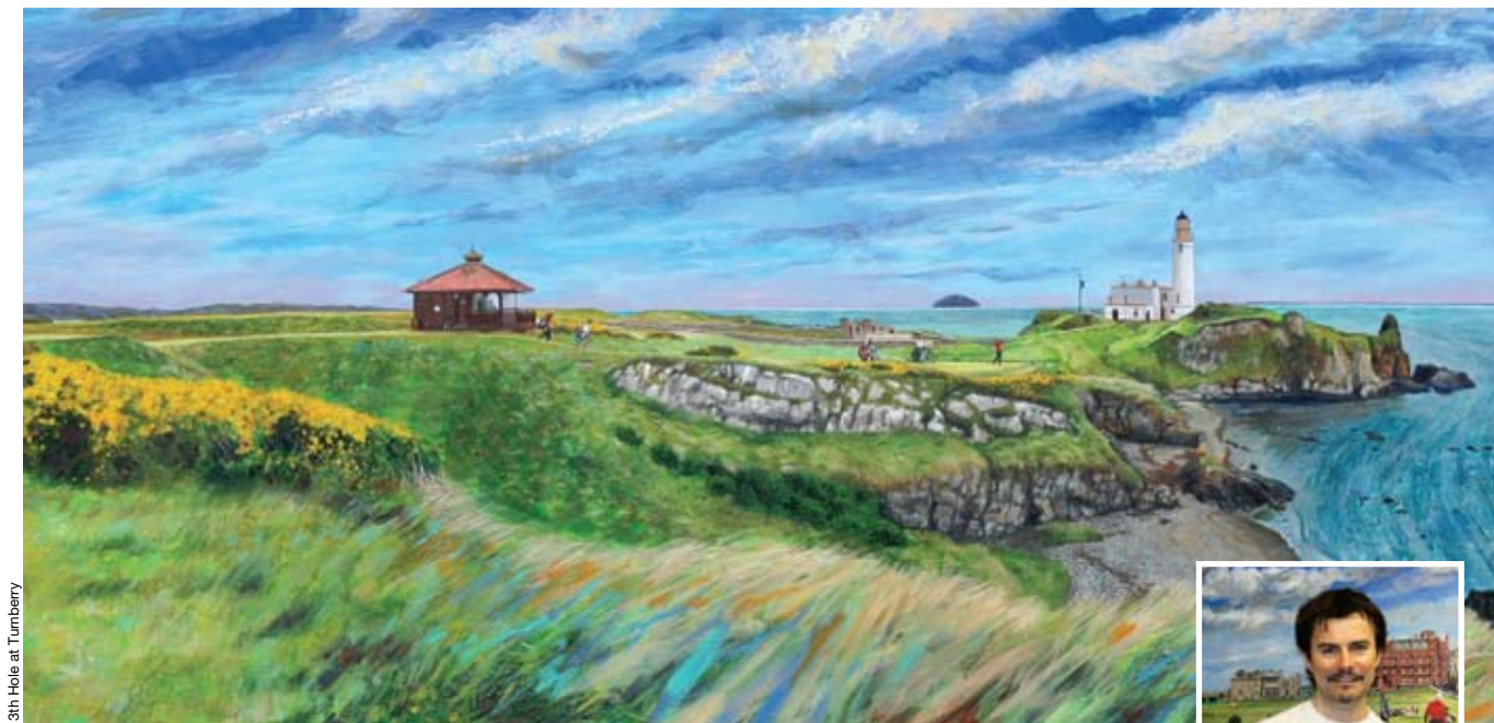
13th Hole at Turnberry