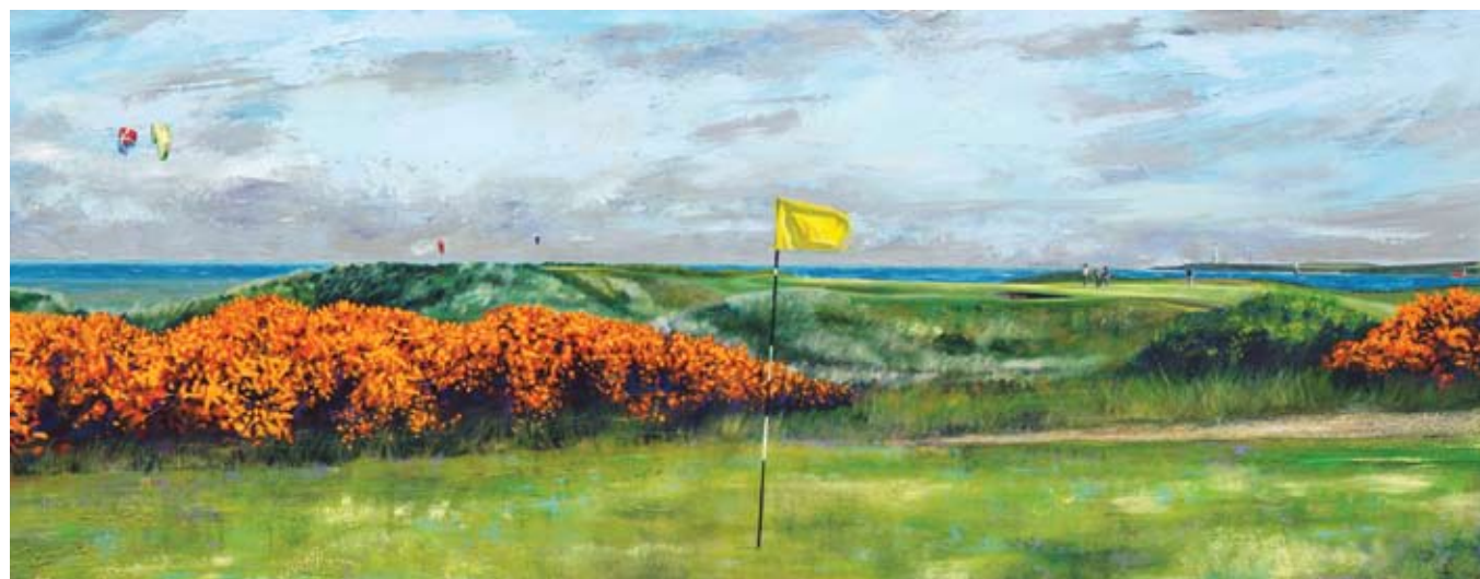
Royal Aberdeen Golf Club (2nd Hole)